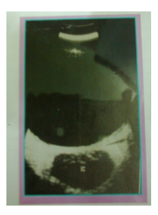
Fig 1: Retrobulbar Abscess and Haemangioma